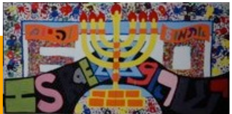
Students helped create this mural during the Chanukah Learning Center