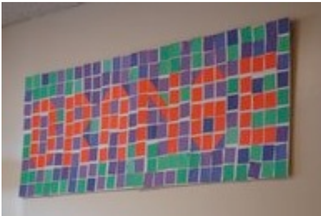
1 st Grade group mosaic illustrating the secondary color "Orange" and cool colors for contrast.

Students in grades K-4, as well as grades 7 and 8, learned about mosaics this month. K-3 helped decorate the school halls with their group mosaic work depicting the primary and secondary colors. The 4 th -8 th grades created compositions using letters and will be using materials ranging from paper to tile in order to create their mosaics. Stop by the Hillel Torah hallways and check out the artwork! Can you read the words hidden in the mosaics?