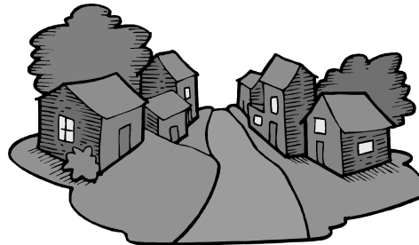
One of these beautiful new homes could be all yours!