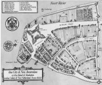
This fine city could be your new home!