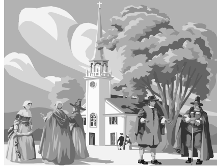
Come and practice your religious freedom today!