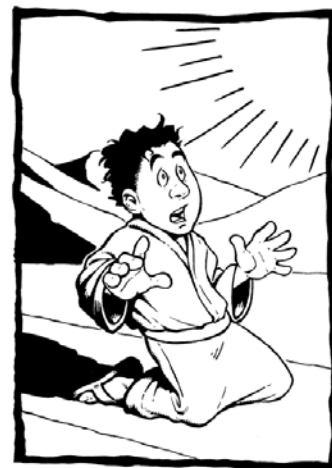
PAUL Acts 9:1-19

As we prepare for the feast of All Saints, take some time to focus on St. Paul and the wisdom he has shared with the Church from its beginnings.