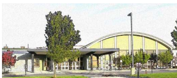
Eagles Nest-Nazareth Area Middle School Podcast & Multimedia Center

As of the beginning of the 07-08 school year, Nazareth Gifted students have a website to showcase their projects. The Eagles Nest-Nazareth Area Middle School Podcast and Multimedia Center , which can be viewed