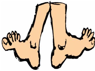
Where your feet went