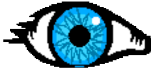
What you saw