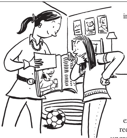
image the company is portraying (example: "Good-looking and popular people drink our soda").

Activity: Cover up brand names in ads. See if your middle grader can guess what they're selling. She may be surprised by how much they focus on attractive models or funny situations rather than on the products. Ask her what